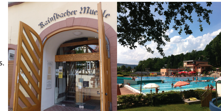
Kainsbacher Mill Public Swimming Pool