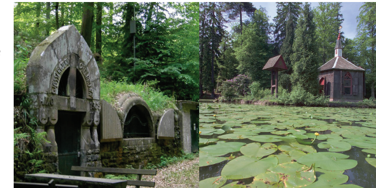
Waterworks in Vielbrunn Eulbacher Park