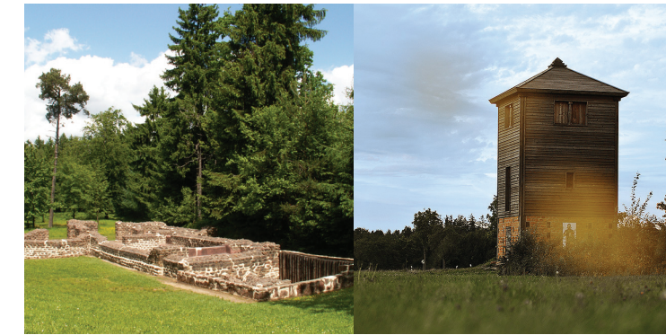
Roman Bath in Würzburg Limesturm in Vielbrunn

Large forests, peaks with overwhelming views and charming valleys make Michelstadt a popular destination also for nature lovers. Sporty people will appreciate a wide variety of beautiful hiking and cycling areas as well as outdoor activities like golfing, tennis and swimming.